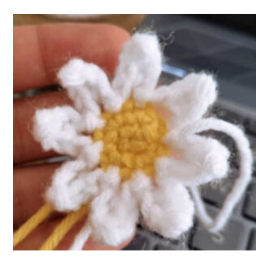
Sew or glue the flower in front of one horn. You can also make a flower crown using a thinner yarn just make 3 of 4 and place them.